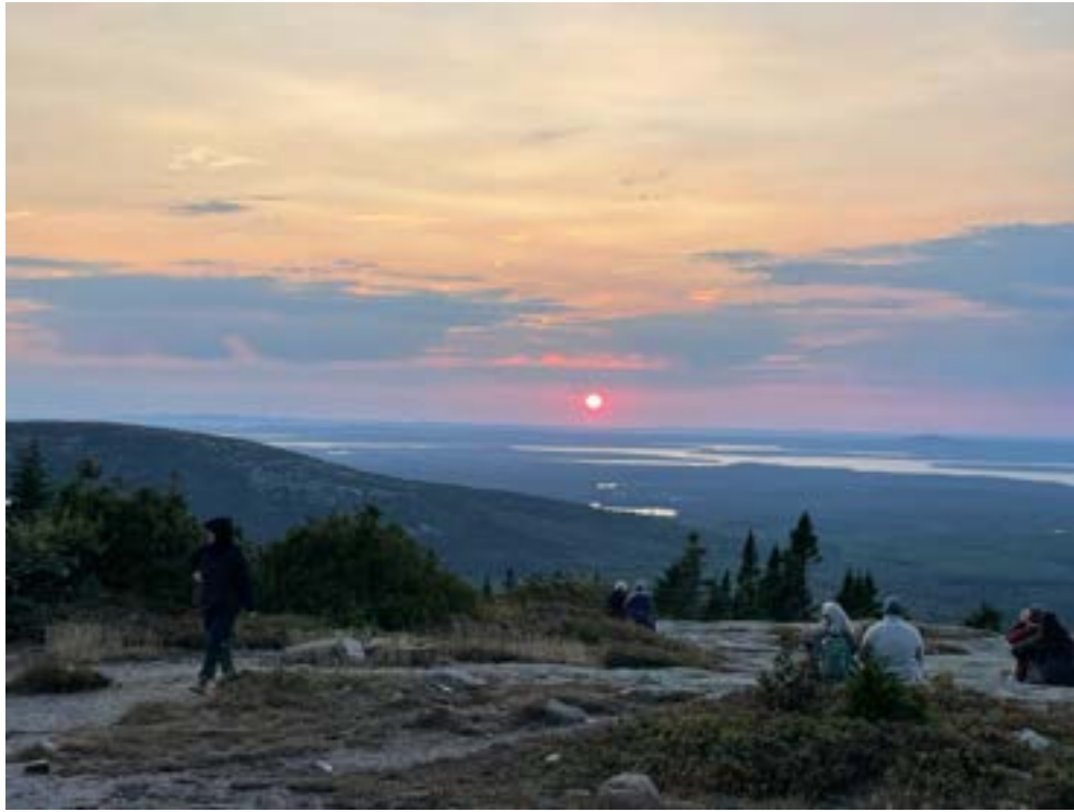
Sunset from Cadillac Mountain, Acadia National Park, Maine