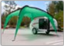
10x10 Cottonwood Shelter

Plus new arrivals, daily deals and live chat with our accessory experts!