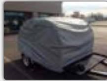
All Weather Cover