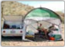
Side Mount Tent