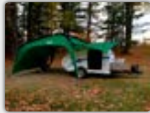
10x10 Cottonwood XLT